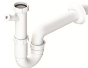
1 x AX1008 (m) 1.0 Bowl pipework