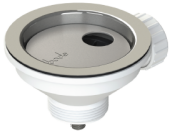
1 x AX1002 (m) 90mm (1.5") Orbit manual basket strainer waste - long bolt